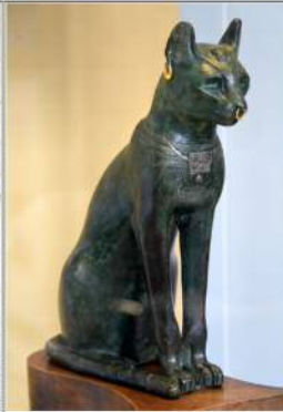
Cat of Bastet