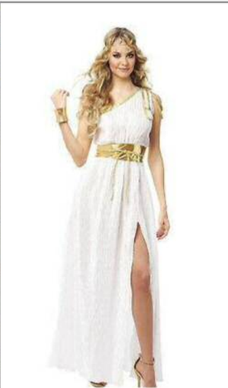
Venus (Kate Upton or Isla Fisher type)