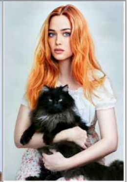
Venus and Bastet