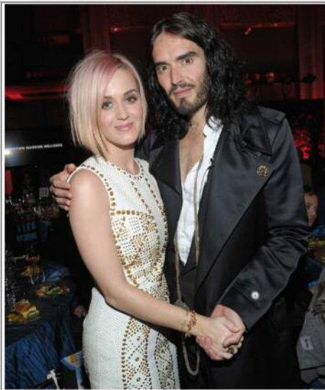
Vitalis (Russell Brand or Johnny Depp type)