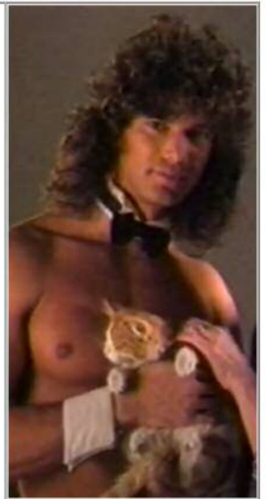
Transcendence (Michael Rapp type)