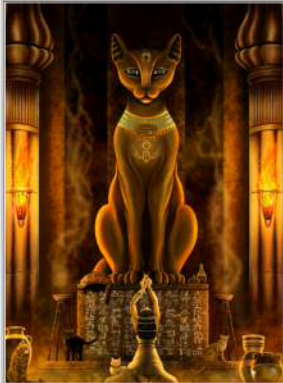
Cat of Bastet reincarnation