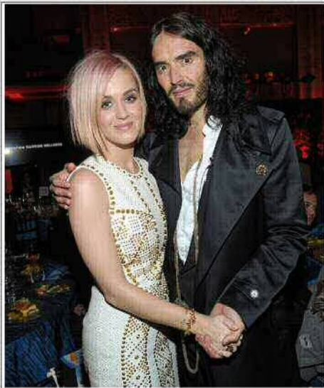
Vitalis (Russell Brand or Johnny Depp type)