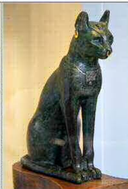
Cat of Bastet