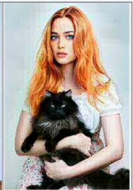
Venus and Bastet