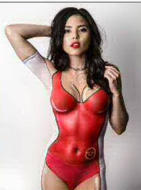
Wenying (Anna Akana type)