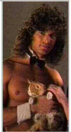
Transcendence (Michael Rapp type)