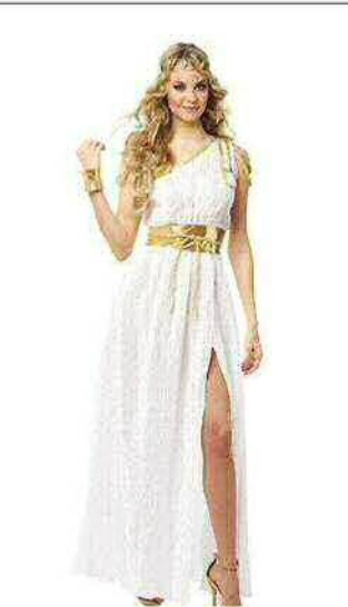
Venus (Kate Upton or Isla Fisher type)