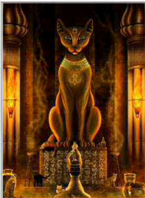
Cat of Bastet reincarnation