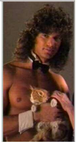
Transcendence (Michael Rapp type)