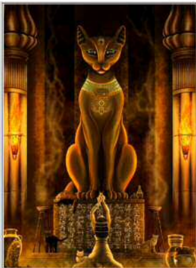
Cat of Bastet reincarnation