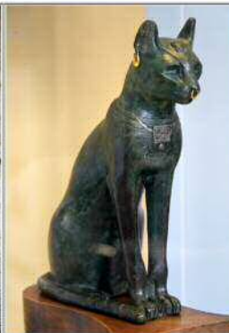
Cat of Bastet