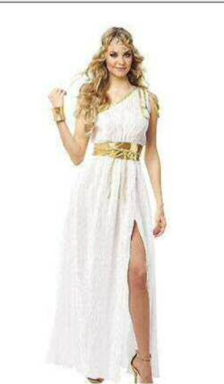
Venus (Kate Upton or Isla Fisher type)