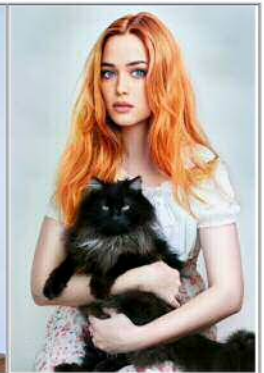
Venus and Bastet